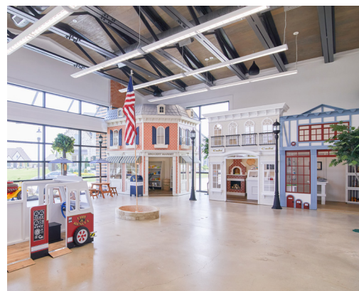
Little Explorer's Club

The playground at the Ridge is an ECHO accredited. ECHO stands for Early Childhood Health Outdoors and is a partnership between the National Wildlife Federation, North Carolina State University's Natural Learning Initiative, and Early Childhood Council Leadership Alliance. The program's goal is to provide young children with access to quality outdoor learning environments.