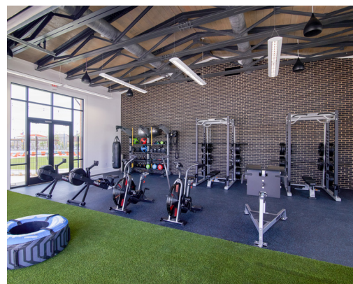
The Altitude Club